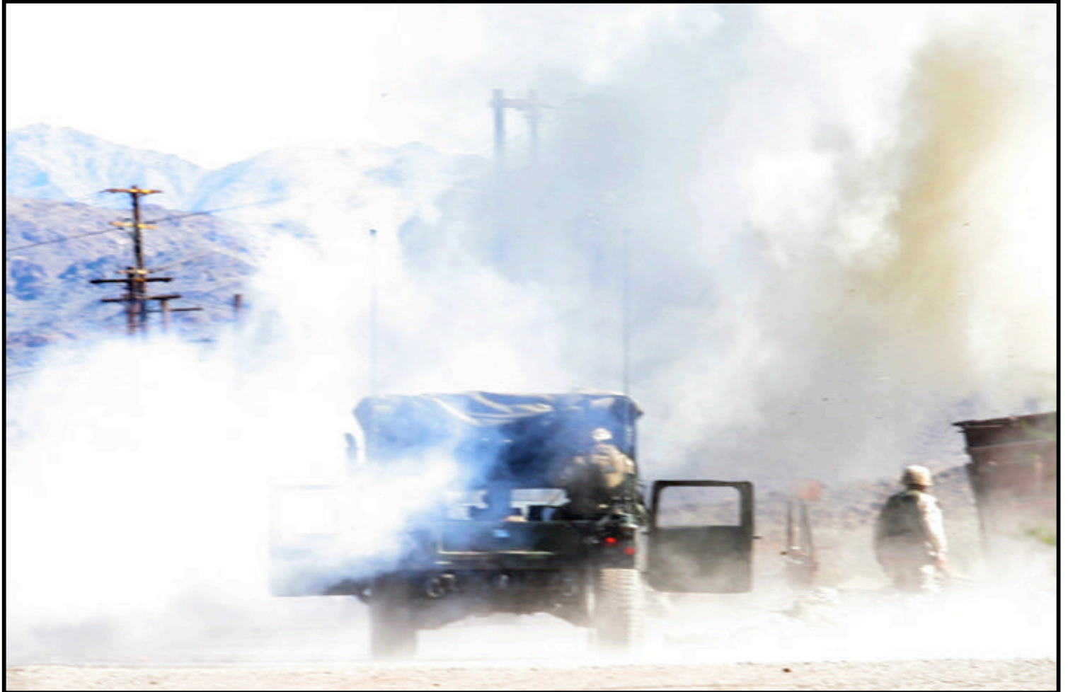
Pyrotechnic Battlefield Special Effects