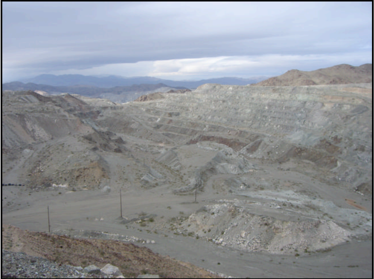
Eastern Portion of Live Fire Desert Training Area