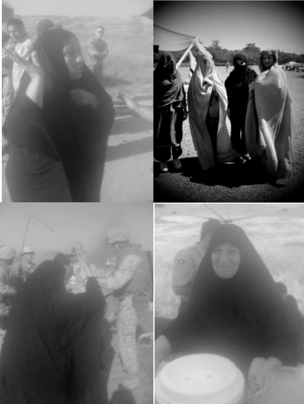
IPG Foreign Language Speakers