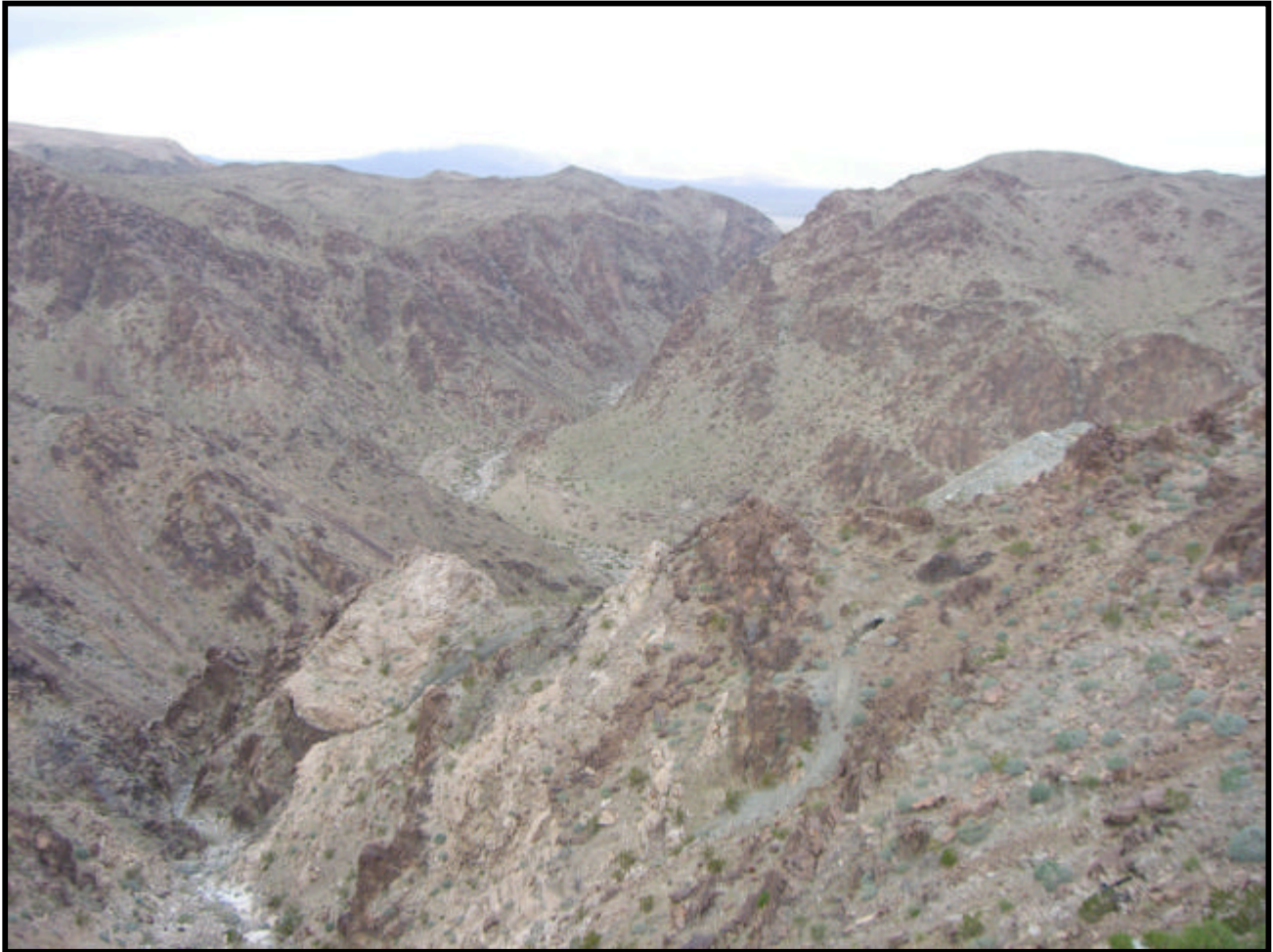
Western End of Training Complex