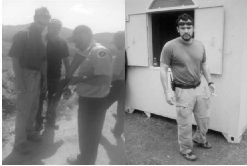
IPG OPFOR Instructors